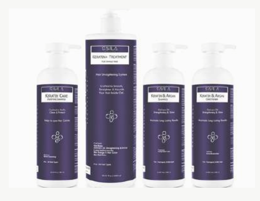
1000 ML kit