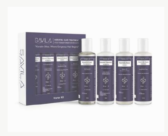
100 ML Stater kit